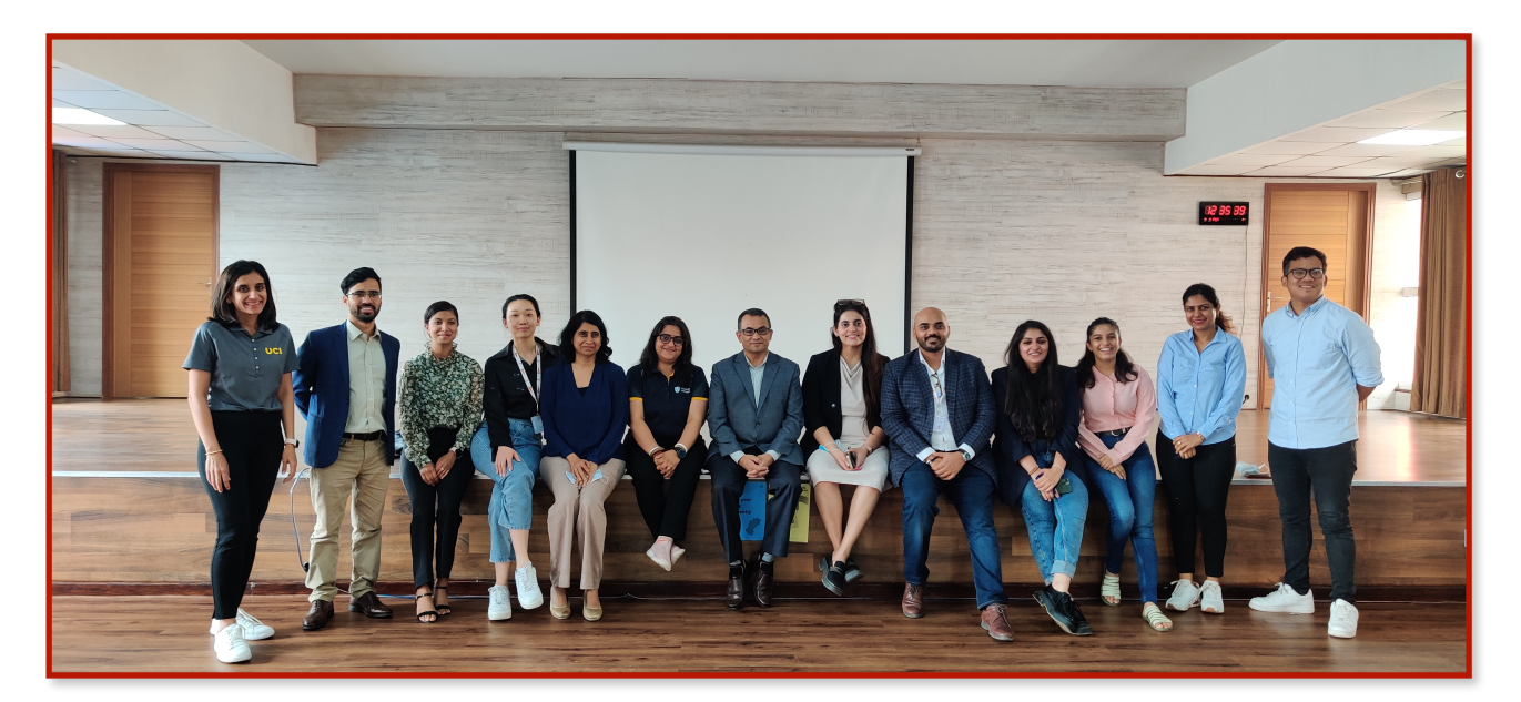
The Campus Connect group visits schools in Kathmandu, Nepal

Logistics: As required, our team will email you a separate price with hotels, internal flights as well as airport transfers based on your requirement. It's usually an additional $500-$600 per city.